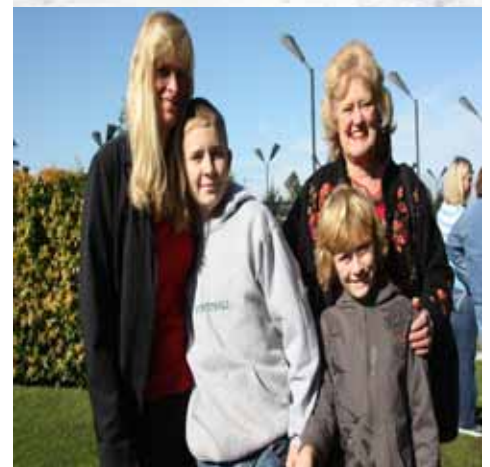
Like SMCC For the Holidays!!